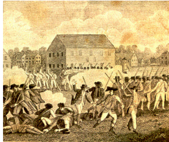
The Battle of Lexington

The anniversary of the Fourth of July has been celebrated by the community with great enthusiasm. Although the Fourth is peculiarly an American day, yet the participation in the amusements of the occasion was so general, and so hearty, that no one could have had a cause to doubt that a great terrestrial jubilee had dawned. Sandwich Islands Gazette Saturday, July 7, 1838