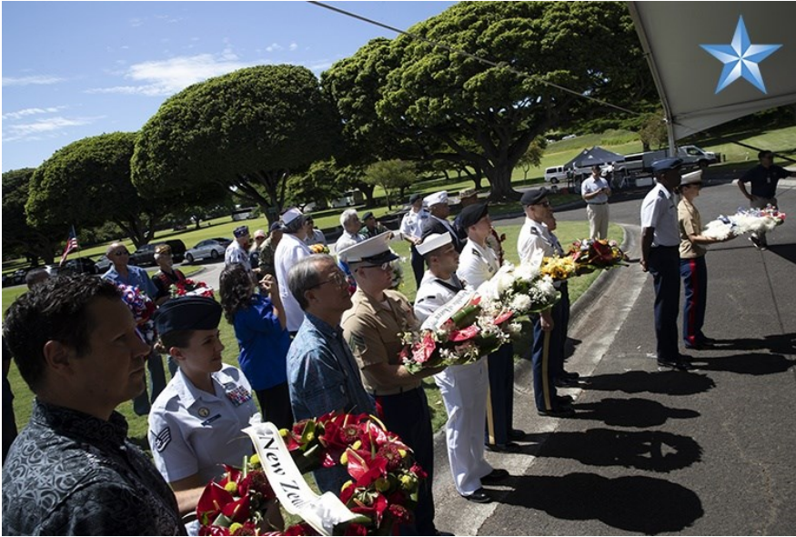
Photo above: Organizations presenting wreaths lined up. This was a rather select group, including the major military commands, several consulate generals, and a few Veterans s civic organizations.